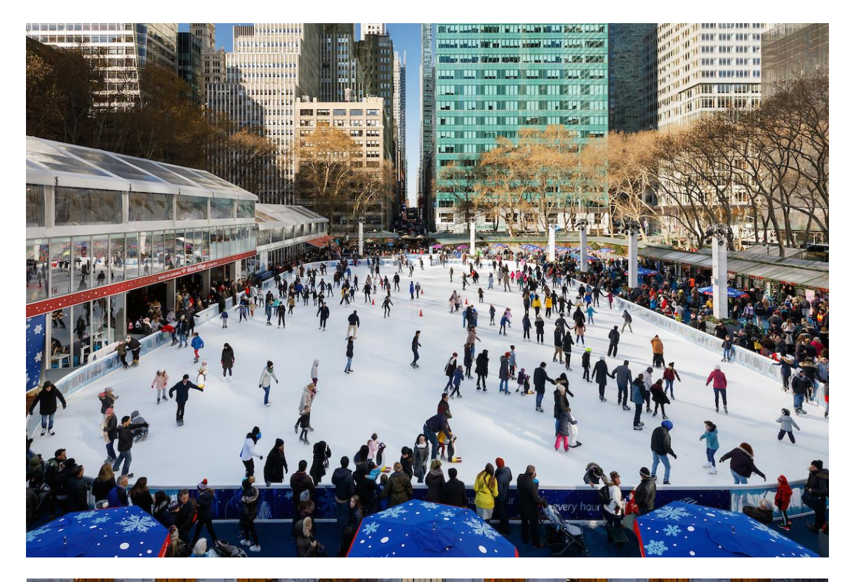
EXHIBIT A: Site Plan and Photographs